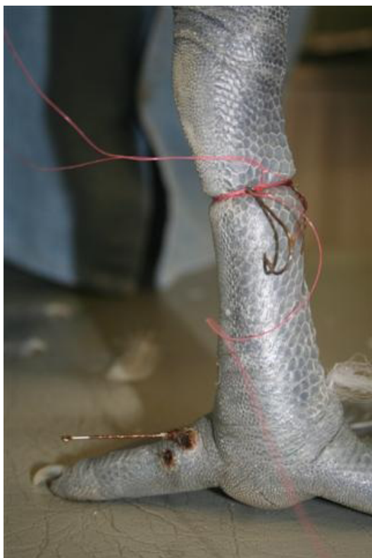
Figure 1. An Australian pelican with a fishing hook injury to the leg, with the attached line forming a ligature. Failure to remove the line may have resulted in deep infection and/or amputation.